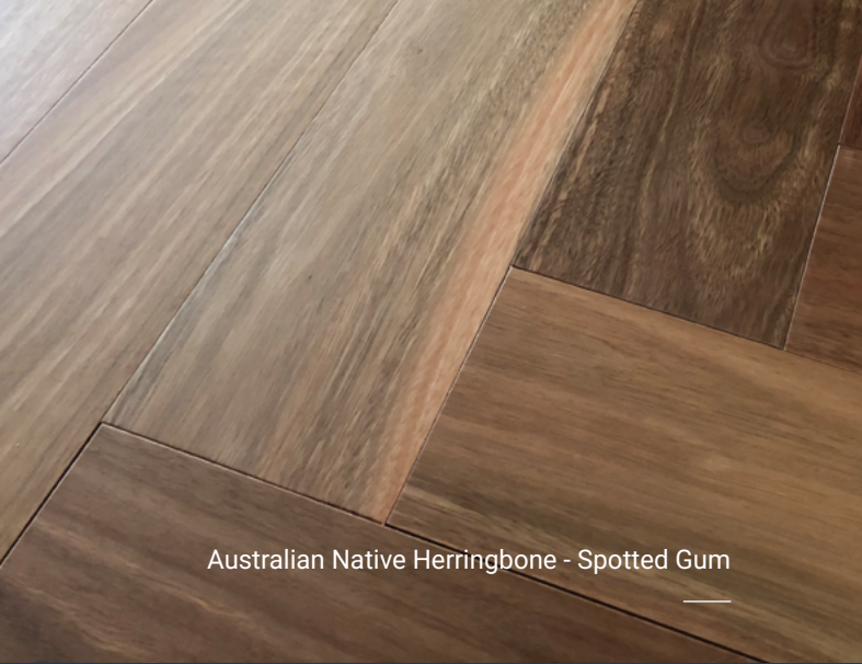
Australian Native Herringbone - Spotted Gum