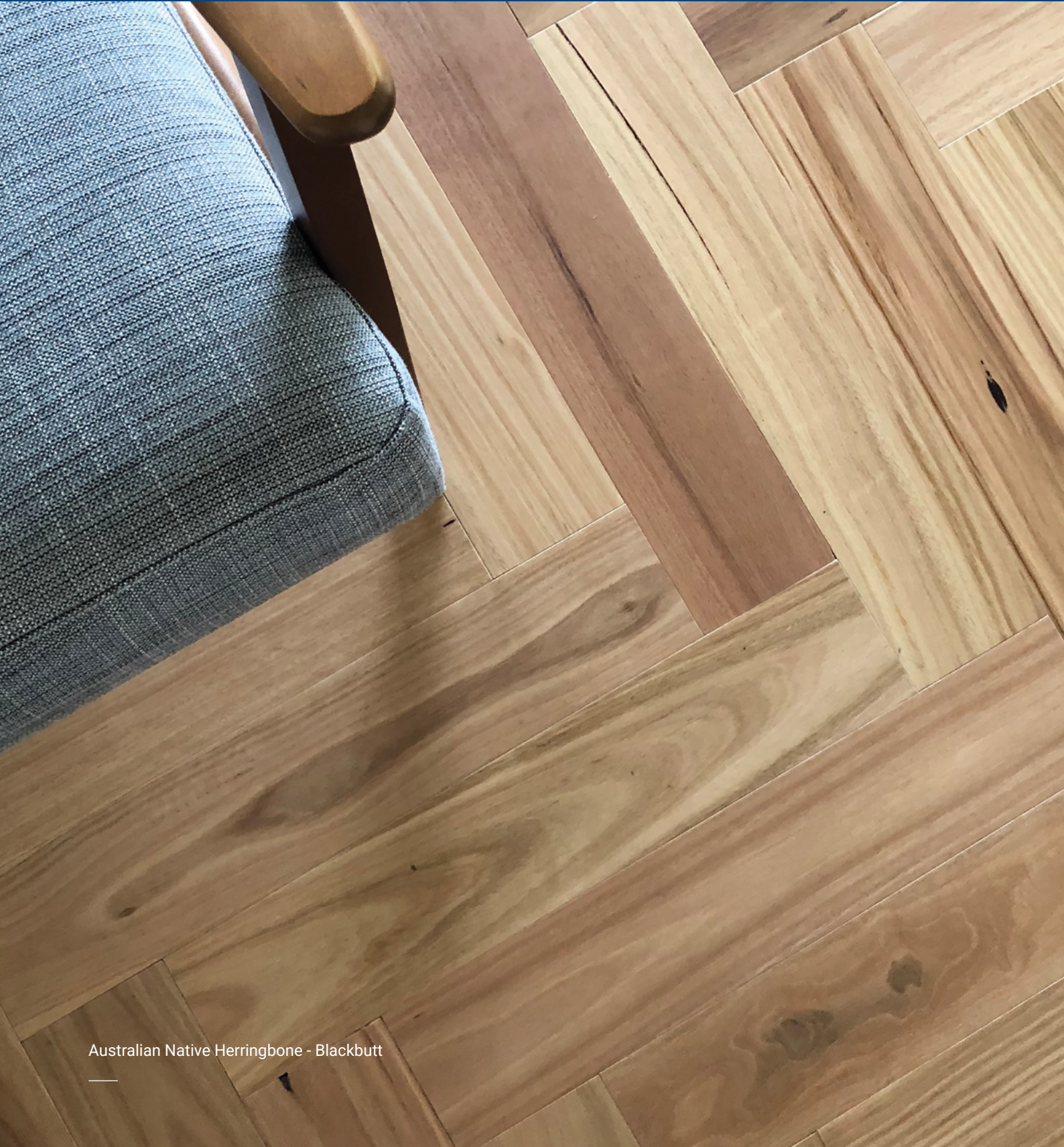
Australian Native Herringbone - Blackbutt